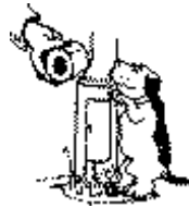
Clean up afterwards!