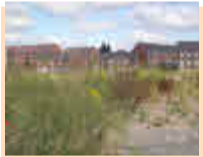
The site as seen from Monmore Grange