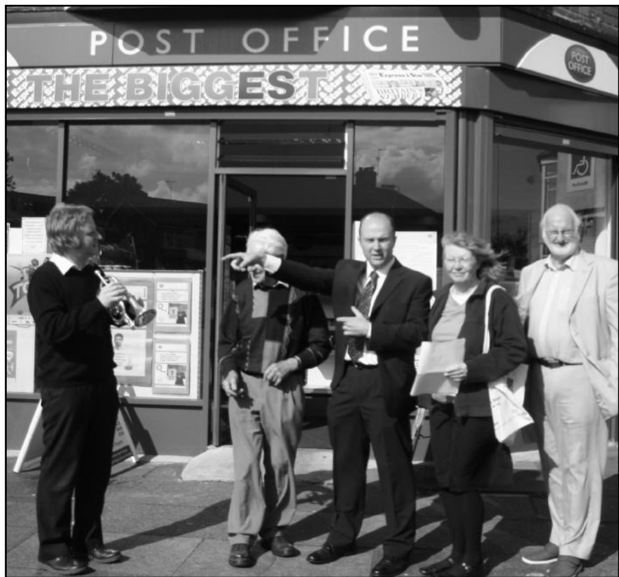
Lib Dem councillors and members meet to campaign to save Newhampton Road Post Office