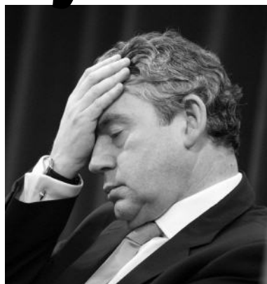
Gordon Brown's proposals to deal with the economic slow down are too little too late

"If the Prime Minister really wants to help people on low and middle incomes he should take the simple and obvious step of cutting their taxes, releasing billions of pounds to boost the economy."